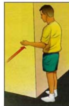
Shoulder Internal Rotation (Isometric)