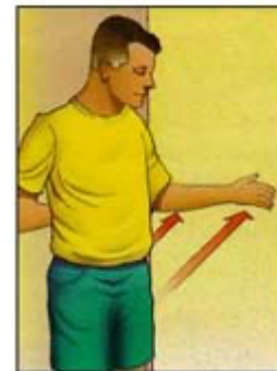
Shoulder External Rotation (Isometric)