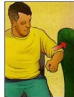
Shoulder Abduction (Isometric)